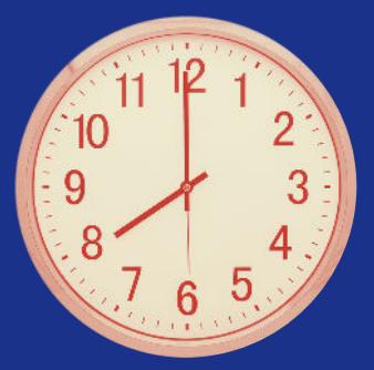
Study Times to suit you

You'll also be allocated a named tutor from our team, who will be your guide and support for that personal touch.